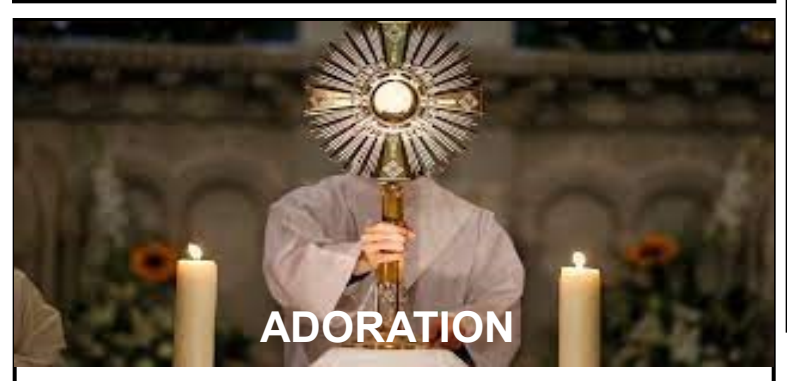
Friday, April 5th, 2024 From 9:00 AM to 7:00 PM

Adoration in front of the Blessed Sacrament in preparation for the upcoming Divine Mercy Sunday. We will be reciting the Divine Mercy Chaplet and offering Divine Mercy Praises every hour for the Dauphin Community, individuals in greatest need, those experiencing physical or mental illness, and those battling addiction.