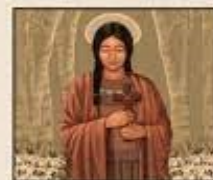
St. Kateri Tekakwitha Lily of the Mohawks

Young Kateri suffered misunderstanding and ridicule due to her counter-cultural choices as a Mohawk to remain an unwed virgin for the love of Jesus Christ. Experience our first Native American Saint's struggles to follow Our Lord within her tribe and through the teachings of some early Jesuit Missionaries.